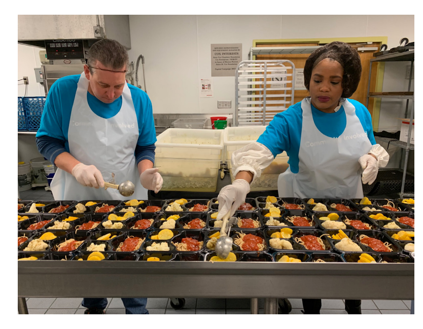
Delta Community employees preparing meals for seniors at Meals on Wheels Atlanta