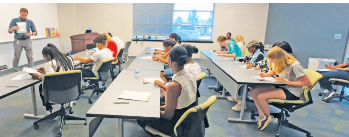
Middle schoolers learned about credit and insurance at Delta Community Credit Union's Cool Cash Money Camp.