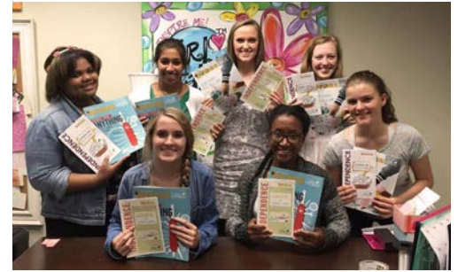
High School students learn about career readiness during "Girl Talk Camp"