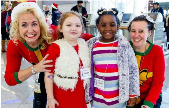
Employee volunteers bring holiday cheer to children during Delta Air Lines' North Pole Charter

In 2015, we sponsored more than 130 community events, including Delta Air Lines' North Pole Charter, the Decatur Business Association's "Slide the City" event and quarterly patient parties at Children's Healthcare of Atlanta. Employee volunteers serve the community by supporting these and many other worthwhile events throughout the year.