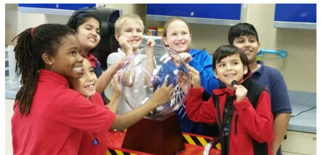
Students from Woodland Elementary with the plasma ball and cart purchased with funds donated by Delta Community

Our PIE program is an ongoing community outreach to schools supporting STEM initiatives, located near our branches.