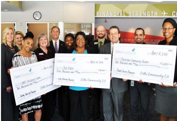
UMC Children’s Home, Our House and the Clarkston Community Center were among the 30 community organizations receiving Philanthropic Fund grants in 2015

In 2015, we invested $75,000 in 30 community organizations supporting education, health and financial awareness through our Philanthropic Fund. More than 7,500 individuals living in communities across 11 metro Atlanta counties were served by the non-profit organizations receiving grants.