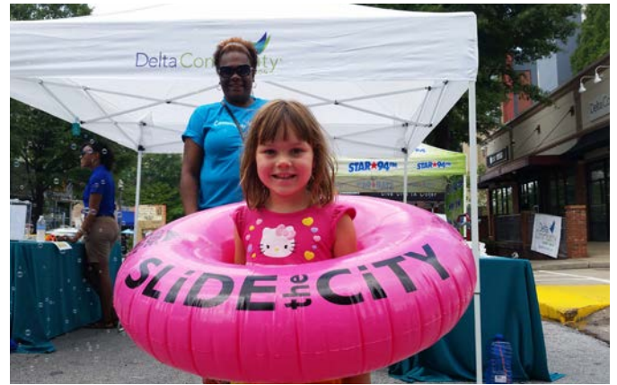
An employee volunteer with a young slider during the Decatur Business Association's "Slide the City" event