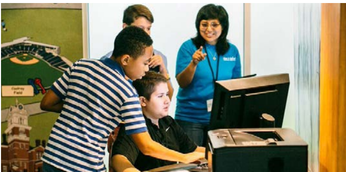
An employee volunteer assists students with their philanthropic donations