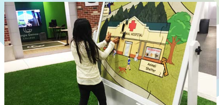
A BizTown student places the last puzzle piece on the board, revealing the organization benefiting from philanthropic giving