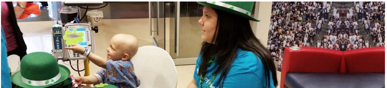
An employee volunteer charms a Children's Healthcare of Atlanta patient during a St. Patrick's Day Patient Party

To learn more about our ongoing support of the communities we serve, visit DeltaCommunityCU.com and click Community . You can also call 404-677-8628 or email Business.Development@DeltaCommunityCU.com .