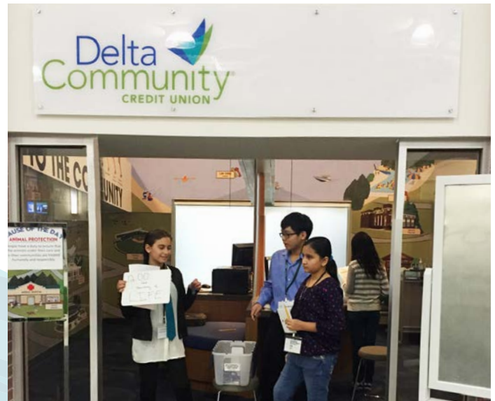
BizTown students outside the Delta Community storefront